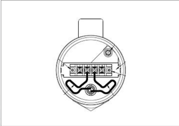
Cast Iron Connection Head Configuration