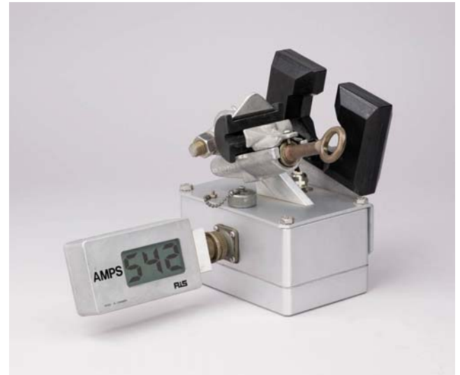
LL-230 with Display attached